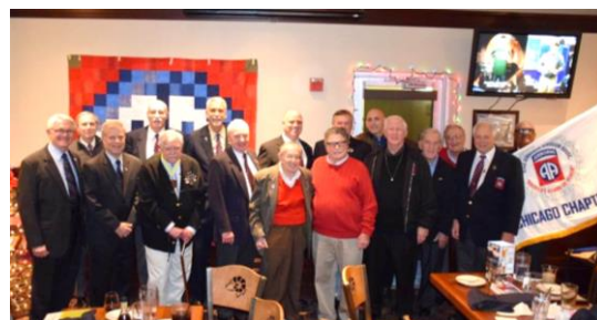
Chapter members celebrate the Holidays.

The 2016 Holiday party will be held 11 December. Please make plans to join us if you can.