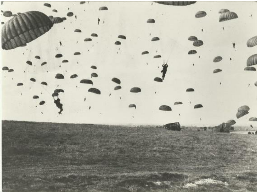
Operation Market Garden