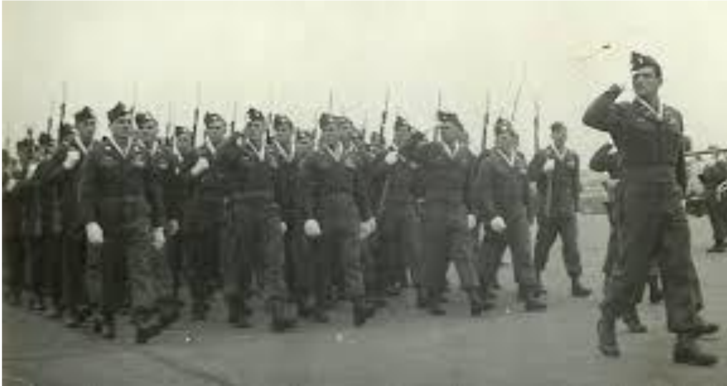
82 nd Airborne Division Passing in Review for General Patton at the end of WW 2.