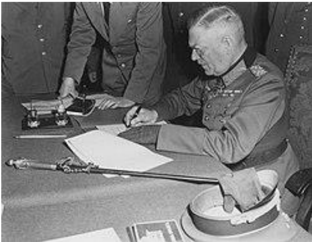
Field Marshal Wilhelm Keitel signing the final surrender terms on 8 May 1945 in Berlin