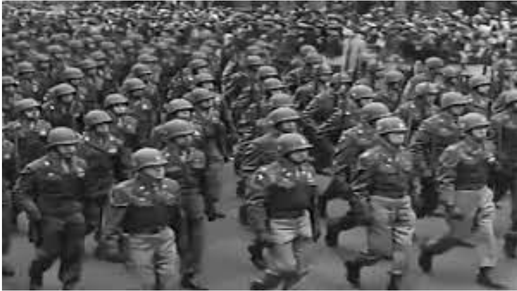
82 nd Airborne Participating in the World War 2 Victory Parade in New York City. January, 2022